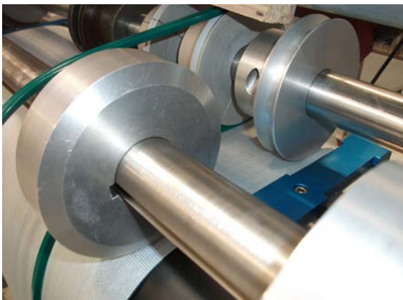
Photo: The machine welding a profile.