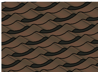
Detail of the A pattern