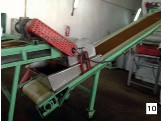
10 to 12. After fermentation the brown tea is transferred to the Dryer on a Clina 20CK/Clina 21CK, Clina 2035, Clina 12CF or Clina 20CF belt.