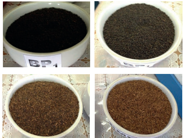
Different grade of Tea.