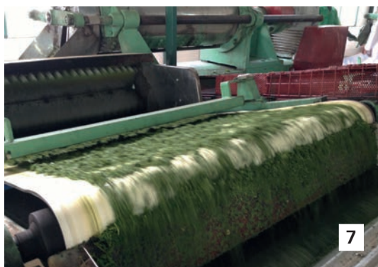
6 to 9. C.T.C. Belt Clina 20CK with bottom tracking guides NE.B11-62.

During C.T.C. phase aggressive juices are in contact with the belt: Clina 20CK (1.5mm thick top cover) or Clina 2035 (1.2mm thick).